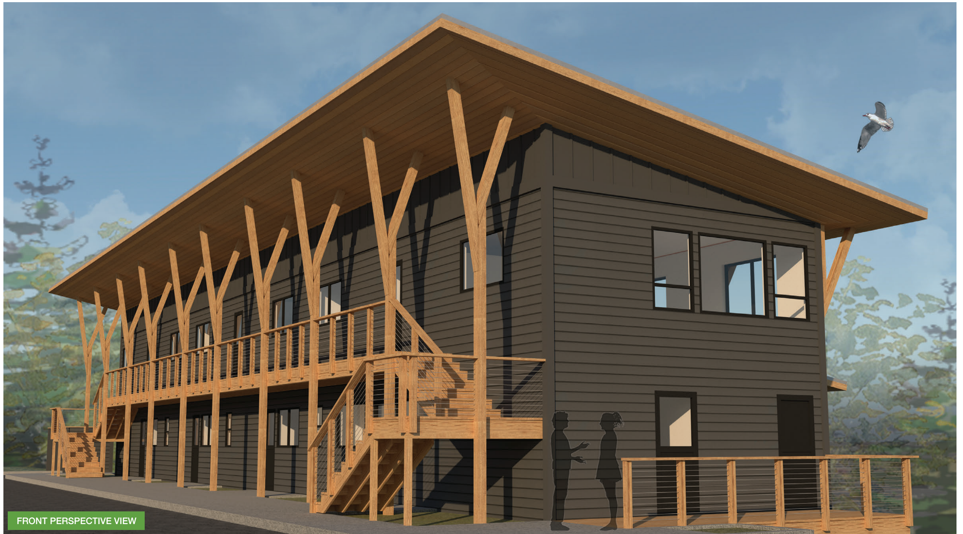
FRONT PERSPECTIVE VIEW